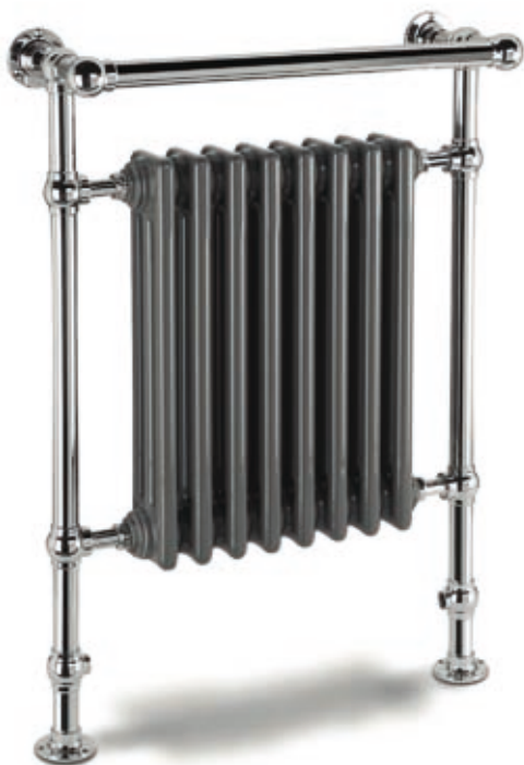
Henley - Chrome/grey