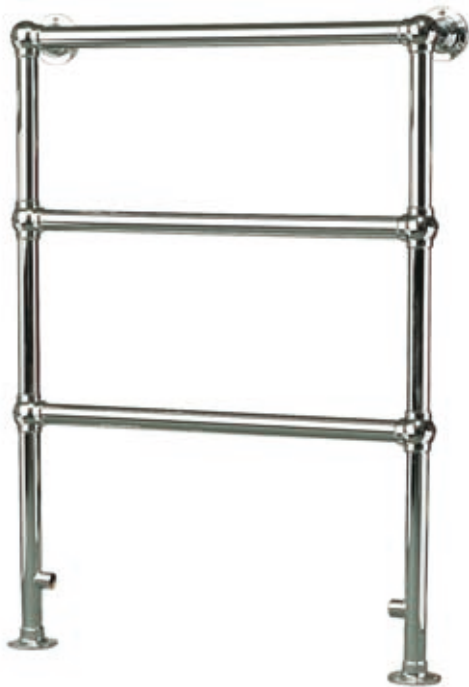
Sandringham - Chrome