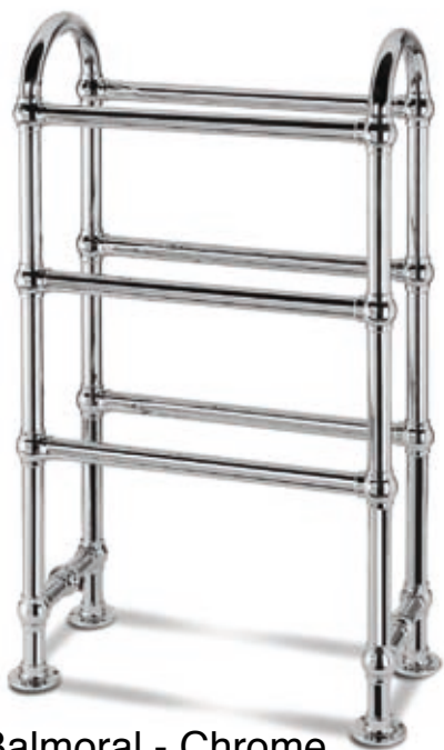
Balmoral - Chrome