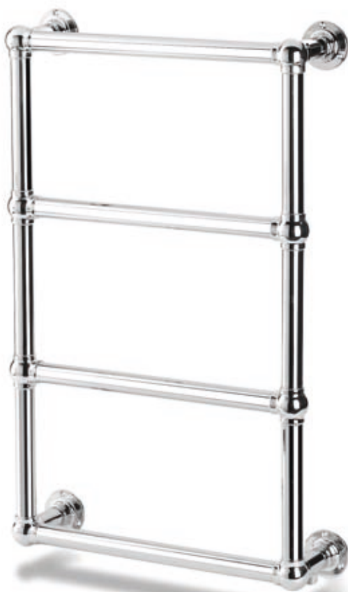
Oxford 2 - Chrome