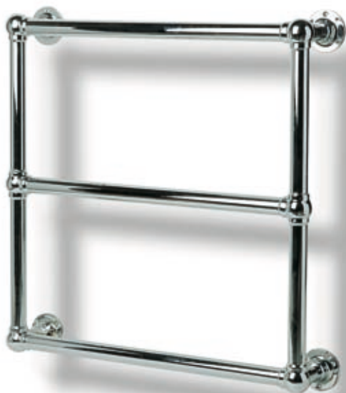
Oxford 1 - Chrome